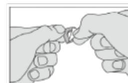
Figure 3: To remove the tablet, fold back the marked corner of the foil and then pull it off. Do not force the tablet through the foil. Doing this may damage it because it breaks easily.