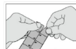
Figure 2: Tear a square off the pack along the perforated lines.