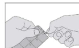
Figure 1: Tear off the strip marked with triangles at the top of the pack.

Make sure your hands are clean and dry before handling the medicine. Follow the instructions below when taking ACARIZAX®: