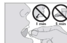
Figure 5: Place the tablet under the tongue. Allow it to remain there until it has dissolved. Do not swallow for 1 minute. Do not eat or drink for at least 5 minutes.

Your doctor should give you the first tablet under medical supervision and then monitor you for 30 minutes. This gives you the opportunity to discuss any possible side effects with your doctor (refer to Side effects).