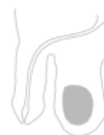
Scrotum - The skin sack that holds the testicles

Always apply ANDROFORTE® 2 cream to clean dry skin. The best area to use ANDROFORTE® 2 is the scrotum (the skin sack that holds the testicles). This is the recommended site of application because absorption is greatest from this part of the body. If a dose greater than 1.5 mL (30 mg testosterone) once daily is required it is recommended that ANDROFORTE® 5 testosterone cream be used. Many men experience a warming sensation of the scrotal skin for a few minutes after applying ANDROFORTE® 2 - this is normal and quickly subsides. No perfume, deodorant, or moisturizing creams or gels should be used on the area because this may interfere with ANDROFORTE® 2 from being absorbed.